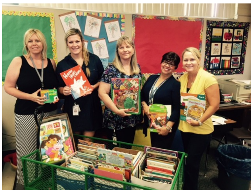
All the Foothill Kindergarten teachers