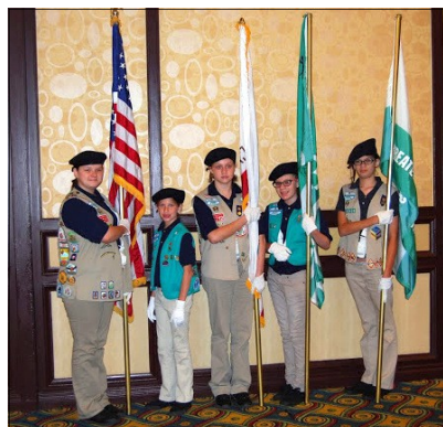
Boy Scout Flag Bearers