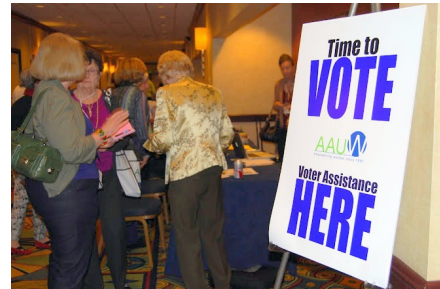
Voting at Convention