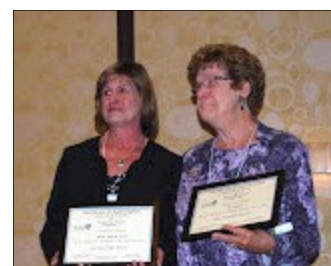
Two big smiles