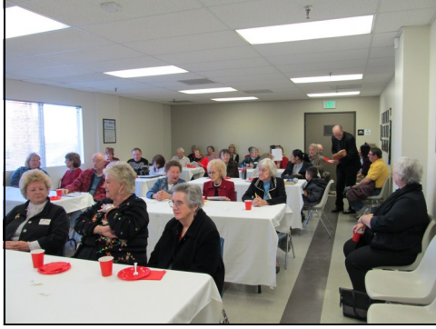
Here is the crowd