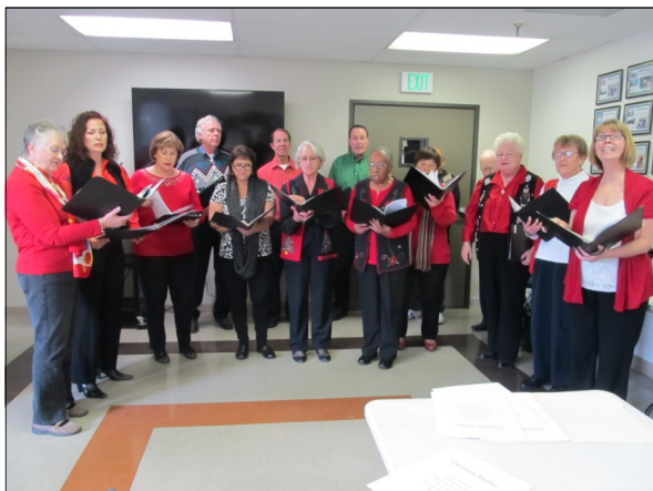
The Moreno Valley Chorale